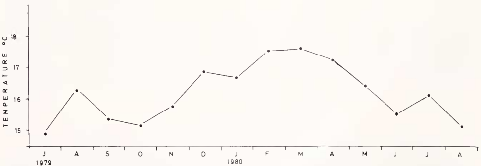
FIGURE 2. Mean sea surface temperatures at Huayquique.

According to Bacci (1947) there is "a certain degree of hermaphroditism" in F. nubecula from the Gulf of Naples, detectable by statistical methods. This means that sex reversal of the protandric type would occur in about 12% in this species of limpet. On the contrary, other papers concerning the anatomy of reproductive organs in Fissurella have described normal ovaries and testis and no signs of hermaphroditism (Boutan, 1885; Ziegenhorn and Thiem, 1925). Ward (1966) reported that there was no indication of hermaphroditism nor of change of sex at any shell length in F. barbadensis . The results of the present study indicate that F. maxima is a dioecious species in which sex reversal has not been detected. No significant differences were found in size classes over 60 mm in shell length (Table III). Personal unpublished observations on the gonads of the eight other Fissurella species from northern Chile (Bretos, 1976) supports this.